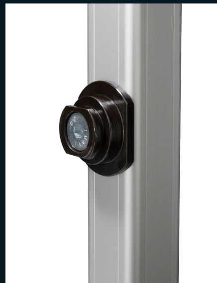
T-32 Shift Adapter

It is now possible to assemble and adjust a complete mobile projection screen system in less than five minutes. Save time AND save money with premium quality components made in Austria.