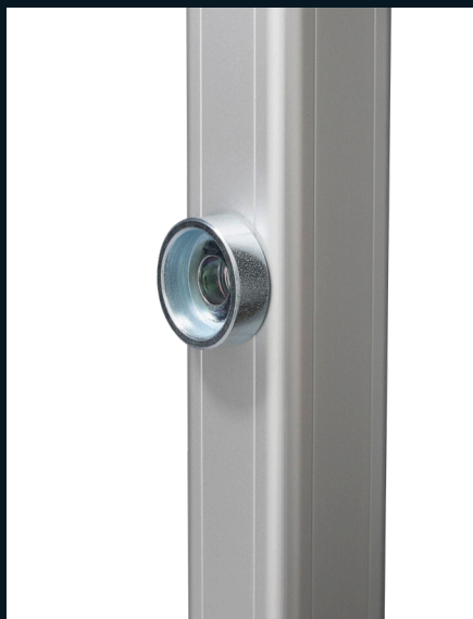
Standard Monoblox Frame